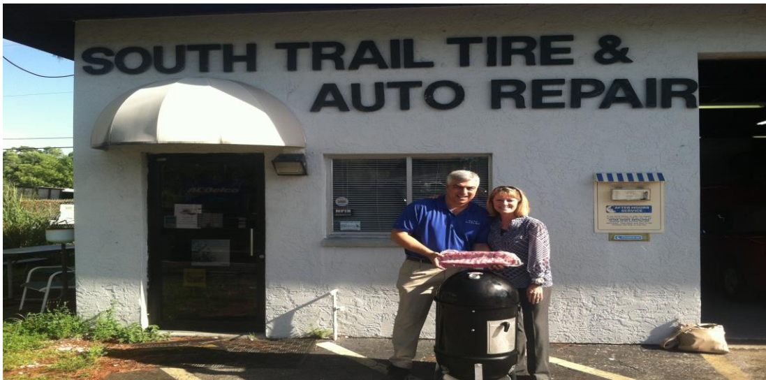
The Truitt Family

Better luck next time when we pick FIVE winners for our ALL TREATS NO TRICKS RAFFLE !!!!!!!