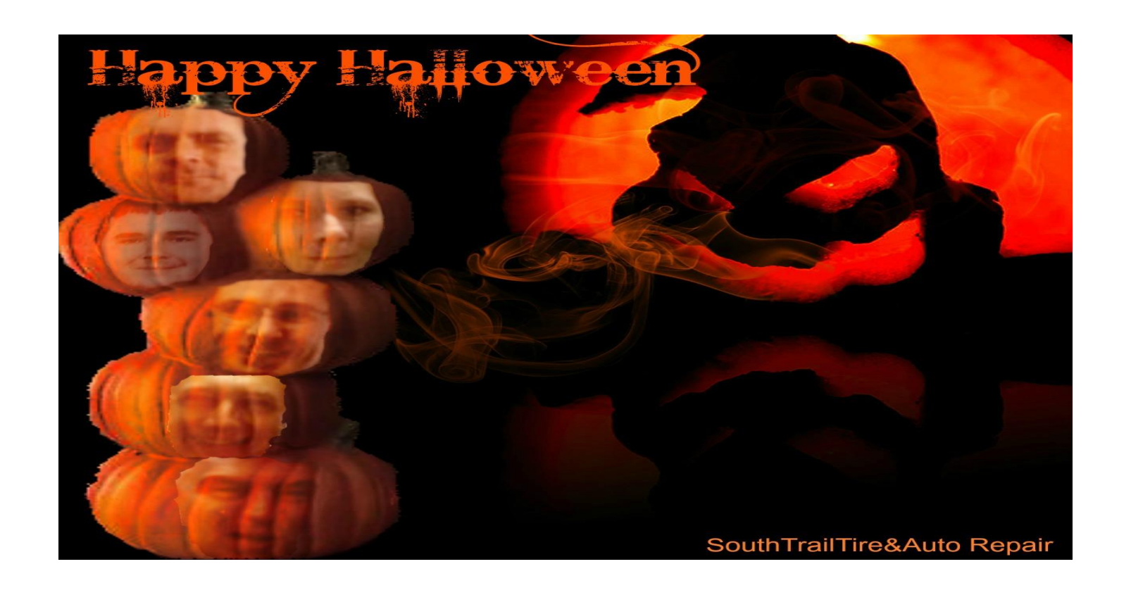
SALES : We will be announcing the winners for our 5 wickedly crafted Halloween baskets on October 21<sup>st</sup>.